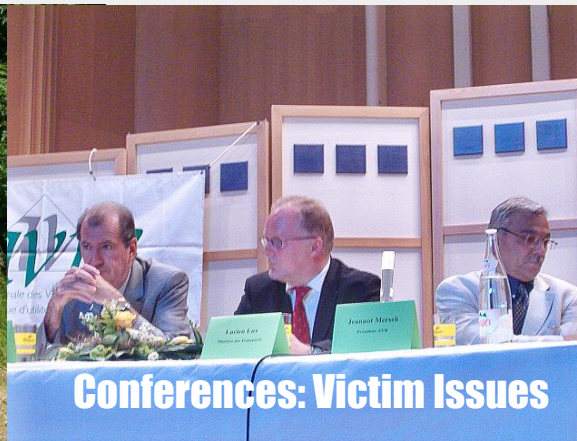
Conferences: Victim Issues