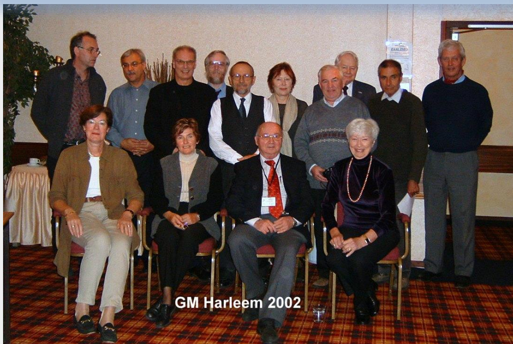
GM Harleem 2002

The suggestion made by Pope John-Paul II to extend the Remembrance Day to the entire World has been followed. We must however consolidate this event further in Europe and involve more the media, police, governments, touring and auto clubs etc. The associations have been asked to provide full information on their actions for the next Remembrance Day, in order to collect sufficient documentation to let this Day be proclaimed by the European Parliament or by the United Nations.