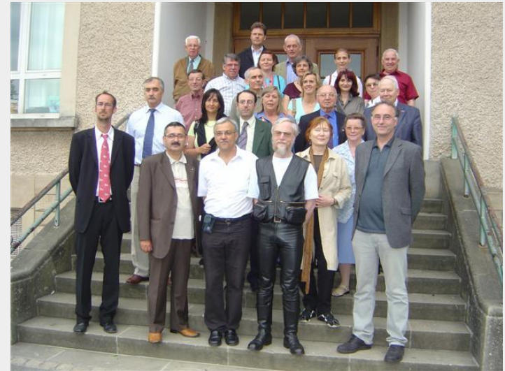
General Assemblies in Luxemburg and in Rhodes