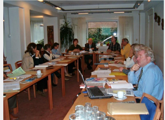
General Assembly Amsterdam

Event Data Recorder & Standards for Crash Investigation