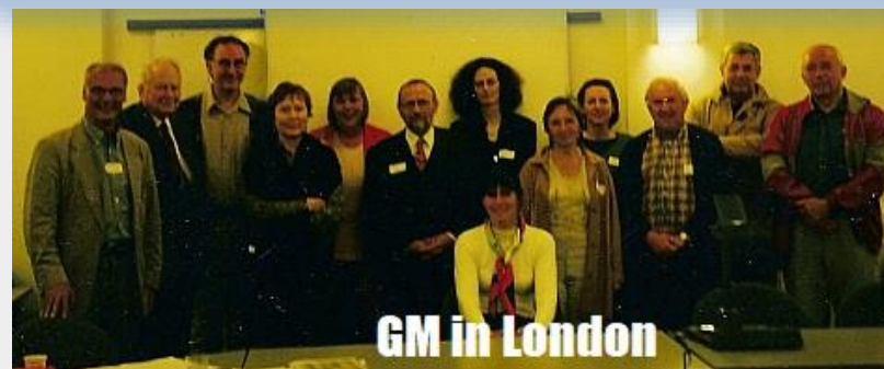
GM in London

Conferences: Road Death & Injury Vision Zero & Intelligent Speed Assistance UN „Victims of Crime“ Resolution FEVR new webpage & Newsletters