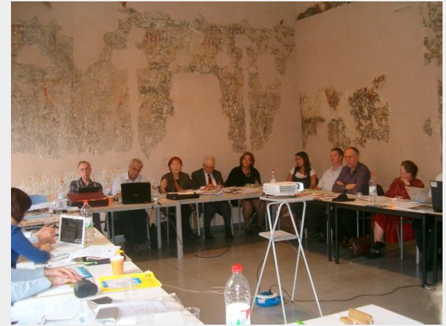
General Assembly Barcelona with Board Elections

UNRSC ( UN Road Safety Collaboration) Meetings in New York & Geneva